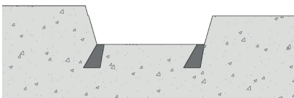
Groove section after removal of damaged profile