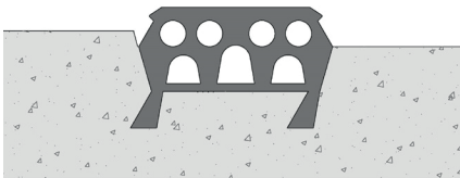
Installation situation of anchored profile

In case of damages caused by mechanical impact during transportation and storage (cuts, breaks, etc.) the sealing gasket has to be replaced at least partially. This can be done by cutting off the sealing profile at its anchoring feet as shown below, followed by replacing this removed section by conventional "brush-on" contact gluing procedure.